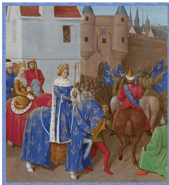
H-1. One Donkey, or Two?

Wikipedia : “The ceremonies and festivities accompanying a formal entry [see the picture, below] by a ruler or his/her representative into a city ... in Europe were known as the Royal Entry, Triumphal Entry , or Joyous Entry. ... Entry of [King] John II of France AND [Queen] Joan I of Auvergne into Paris after their coronation at Reims in 1350 ...” ( https://en.wikipedia.org/wiki/Royal_entry ).