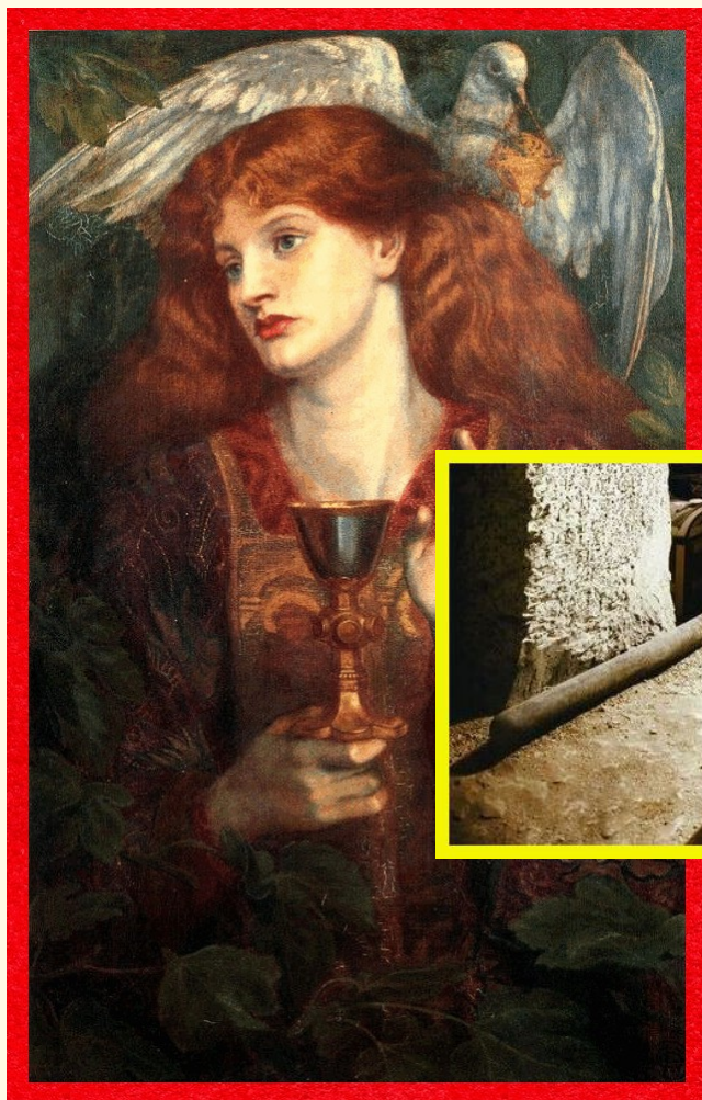
Painting by Dante Gabriel Rossetti

*** Literally, the most valuable discoveries of all time ***