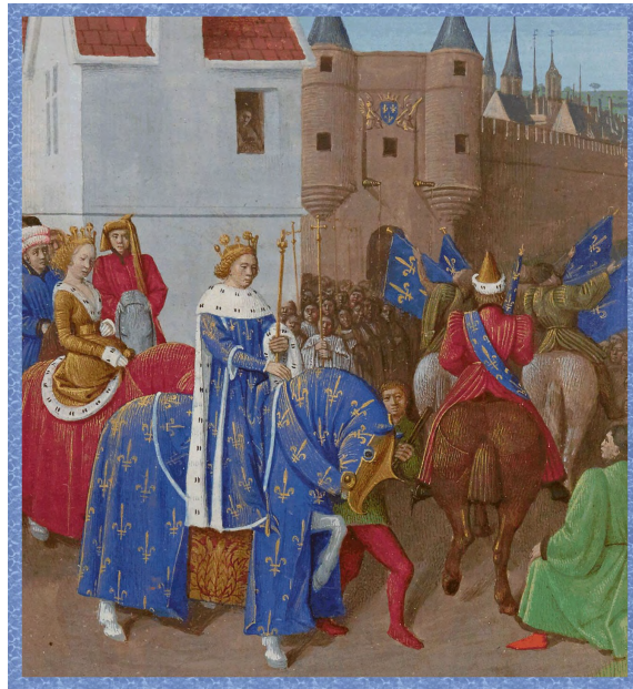
H-1. One Donkey, or Two?

Wikipedia : “The ceremonies and festivities accompanying a formal entry [see the picture, below] by a ruler or his/her representative into a city ... in Europe were known as the Royal Entry, Triumphal Entry , or Joyous Entry. ... Entry of [King] John II of France AND [Queen] Joan I of Auvergne into Paris after their coronation at Reims in 1350 ...” ( https://en.wikipedia.org/wiki/Royal_entry ).