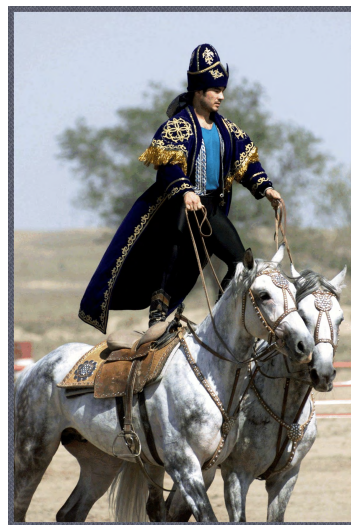
H-4. Male and Female: Disciples, Donkeys, Clothes, and Riders

At this point, it should be relatively easy to put the last pieces in place—about the two donkeys, and the two riders. Jehovah carefully hid TWO genders, in four distinct categories: the two disciples , the two donkeys , the two types of clothes , and ultimately the two riders (King and queen).