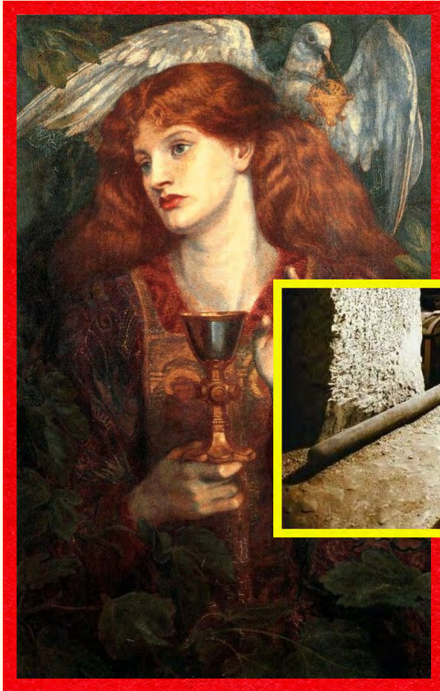
Painting by Dante Gabriel Rossetti

*** Literally, the most valuable discoveries of all time ***